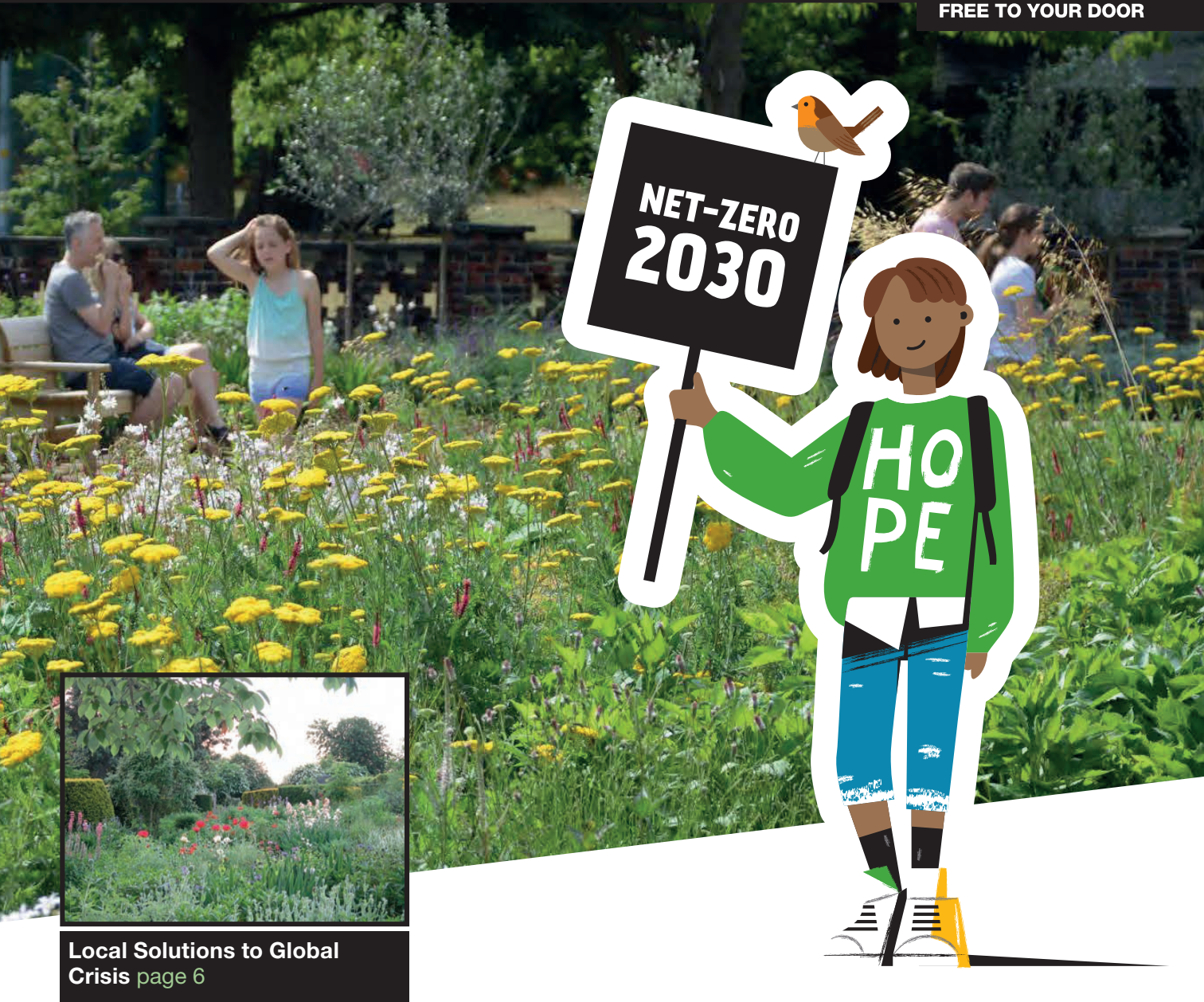
Local Solutions to Global Crisis page 6