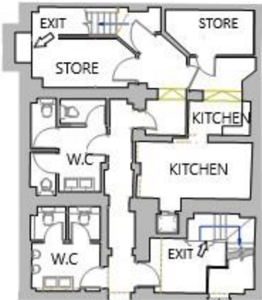
BASEMENT FOR 102-104 BASEMENT